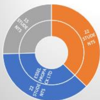
PLACED STUDENTS (2022-23)